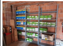
#20: N. 17 Campate di Scaffalatura Metallica