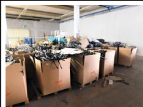
#6: Stampelle e Attaccapanni