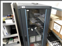
#24: Attrezzatura Elettronica e Informatica - B