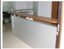
#2: Office Furniture and Equipment - A