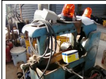
#31: Reciprocating Saw Sawmill 32