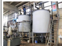
#10: Lot of Tanks