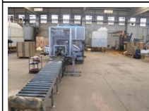
#3: Bottling Line 3