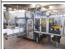
#4: N. 2 Bottling Line