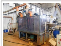
#2: Bottling Line 1