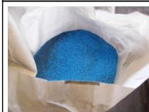
#12: Perfumes and Chemical Substances