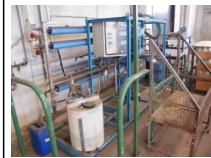
#8: Work Equipment