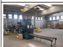
#5: Bottling Line 6