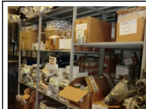
#85: Accessori per Indumenti