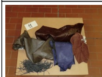
#90: Vari Ritagli