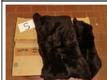
#88: Ritagli in Montone