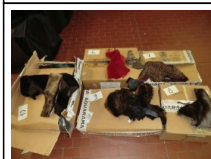
#89: Ritagli in Montone