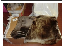
#86: Lotto di Pelli